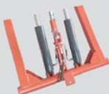
Dual Cylinder Structure