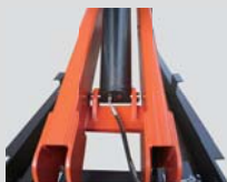
4-cylinder synchronizing structure