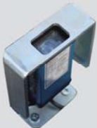
Laser distance sensor

Limit switch to ensure the cylinders work within its maximal stroke.