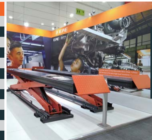
HEAVY DUTY LIFT