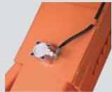
Pneumatic Release System