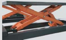
Wheel Free Lift