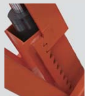
Pneumatic Release Mechanical Lock