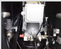
High Quality Ball Valve