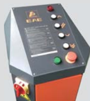
24v Safe Control System